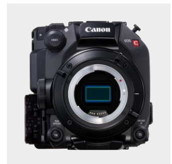
EOS C300 Mk III